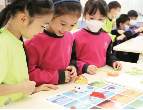
二年級進行 matatalab 實物編程活動