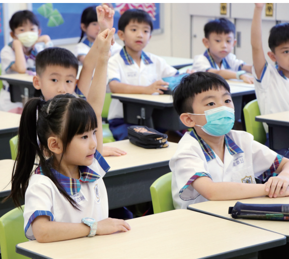
踴躍地舉手回答老師的提問