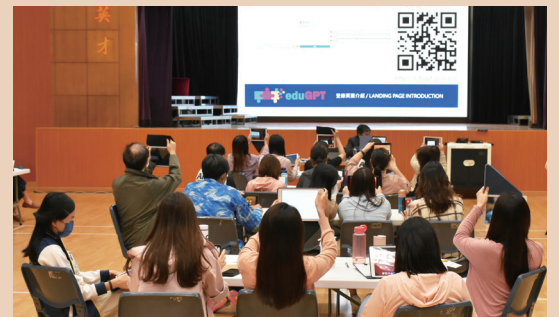
教師專業發展日 - 使用 AI 平台工作坊

Our school has established a teaching and learning research team for years. The aim is to build a culture of reflection among our teachers. Teachers are encouraged to continuously engage in education research through peer collaborations.