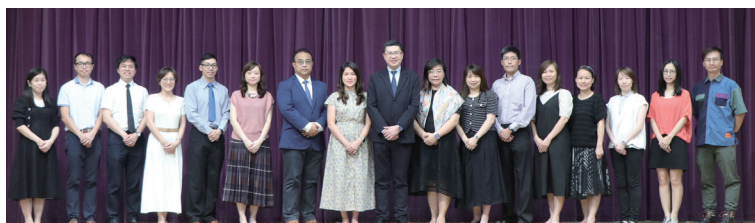
School Core Team