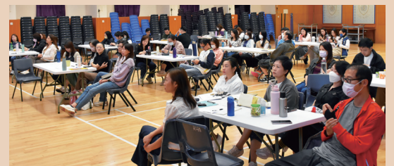
教師發展日 - 教育局課程發展主任到校主持課程發展新重點工作坊