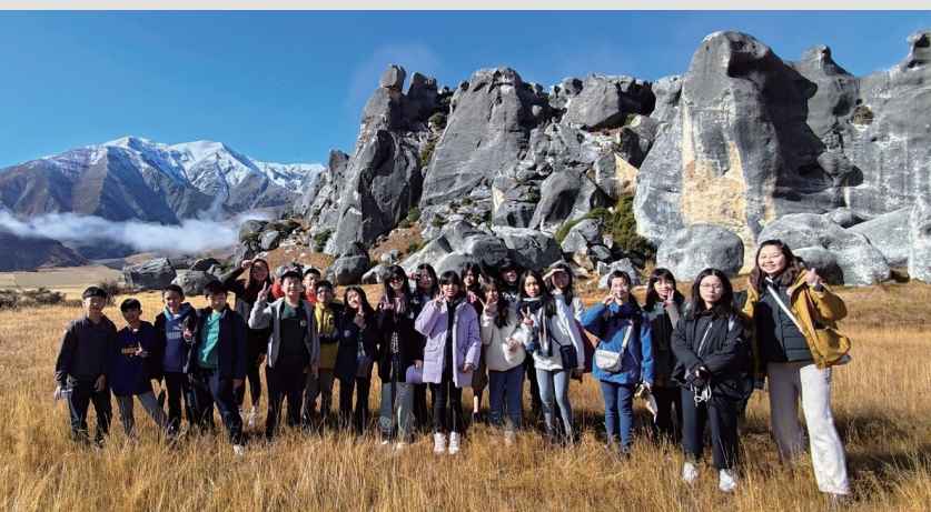
Students hiking in New Zealand during the study tour