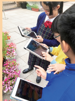
五年級同學正利用 iPad 尋找西遊記內的場景