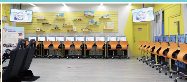
STREAM Inno-tech Lab