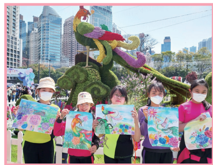
香港花卉展覽 2023 賽馬會學童繪畫比賽

「生活就是藝術；藝術就是生活。」本校藝術教育課程讓學生建構音樂及視覺藝術的知識，並透過不同的藝術方式表達自己的所思所想，培養學生的共通能力。透過參與不同的藝術活動或比賽，讓學生獲得愉悅和滿足，培養美感和正確的價值觀，期望將藝術融合於生活中，豐富個人生命素質，讓藝術成為終身的興趣。