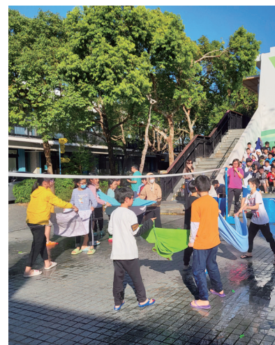
教育營裏學習團體合作