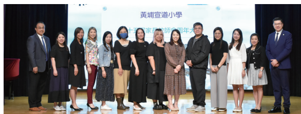
Parent-Teacher Association Committee