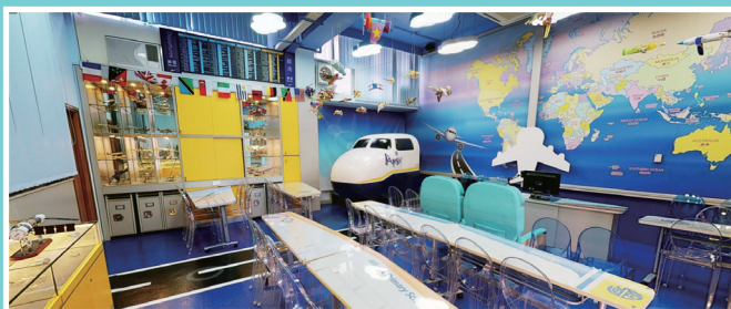
Aviation Discovery Centre