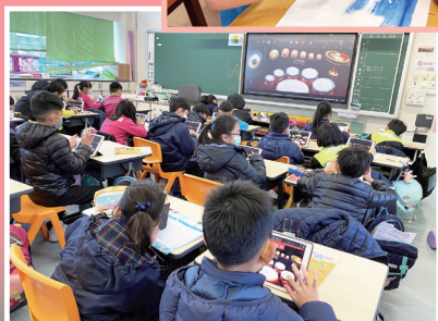
電子學習 中國敲擊 樂器

"Life is art; art is life." Our school's Arts education curriculum allows students to construct knowledge of Music and Visual Arts and express their thoughts and ideas through different forms of art, fostering their generic skills. By participating in a variety of artistic activities or competitions, students gain pleasure and satisfaction, they're able to cultivate a sense of beauty and proper values. We hope to see students integrate art into their lives to enrich their human qualities, making art a lifelong interest.