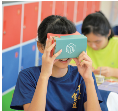
六年級體驗 VR 太陽能發電系統探究

The science and humanity curriculum is committed to cultivating students' inquiry and higher order thinking skills and promoting STREAM education. Through diverse experiential learning activities, such as site visits, field trips, interviews and experiments, we enable students to gain firsthand learning experience and a deeper understanding of themselves, their families, their society, their country and the world, thereby broadening their horizons. These activities also inspire students' curiosity and interest in science and technology. Through our school-based curriculum, we hope to enable students to enjoy the fun of learning about science and humanity while developing creativity and problem-solving skills.