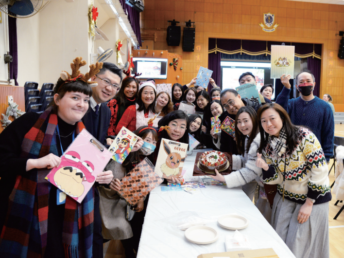
Fellowship and Birthday Party