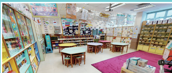
English Reading Castle