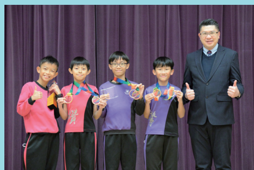
全港 Rummikub 聯校小學邀請賽

Our school has a Math Olympiad Team that provides a platform for students with excellent mathematical abilities to showcase their talents. Since its establishment, the team has achieved good results in external competitions, which has built up students' confidence and sense of belonging to the school.